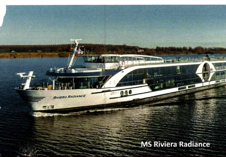
MS Riviera Radiance